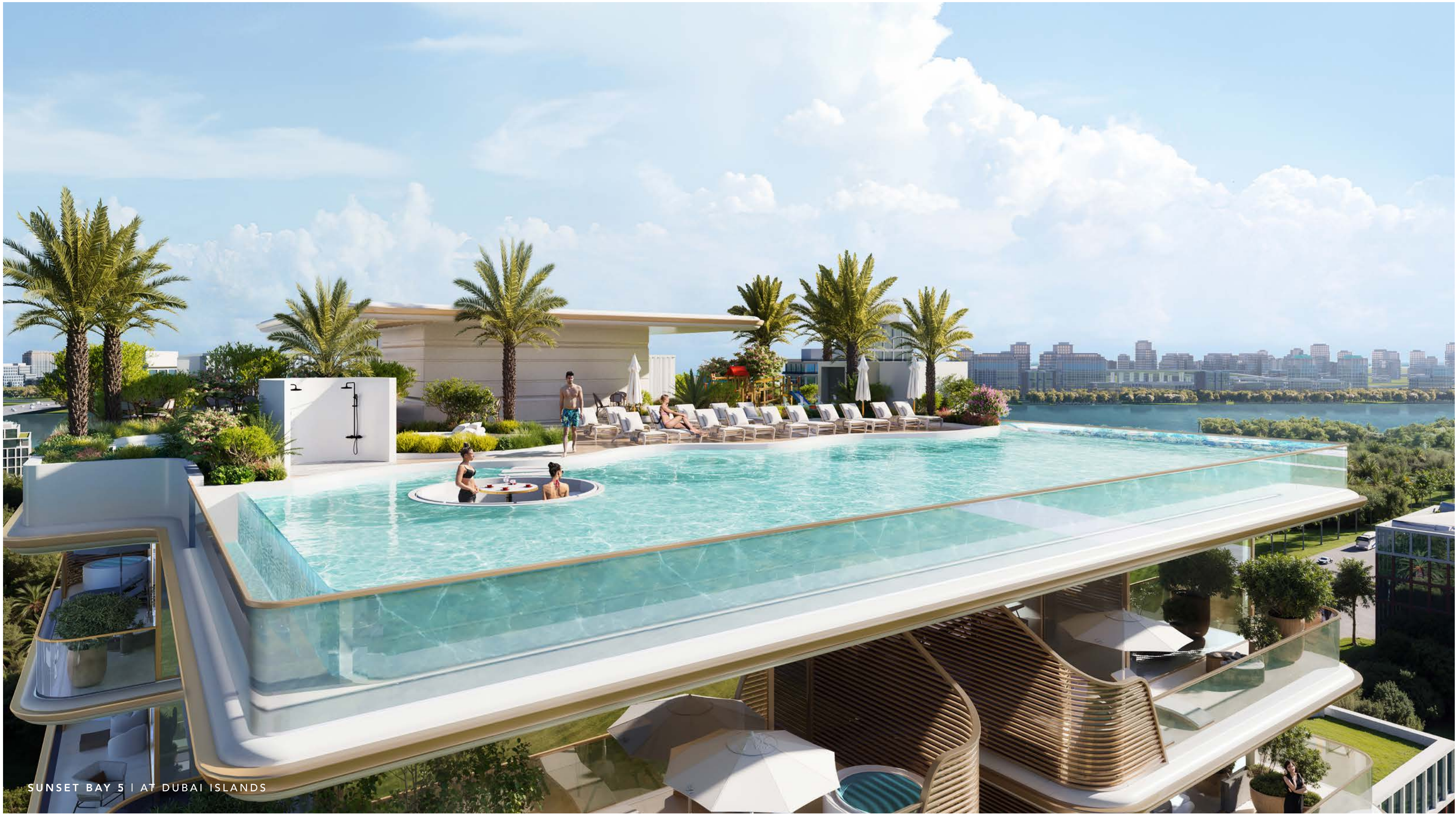
SUNSET BAY 5 | AT DUBAI ISLANDS