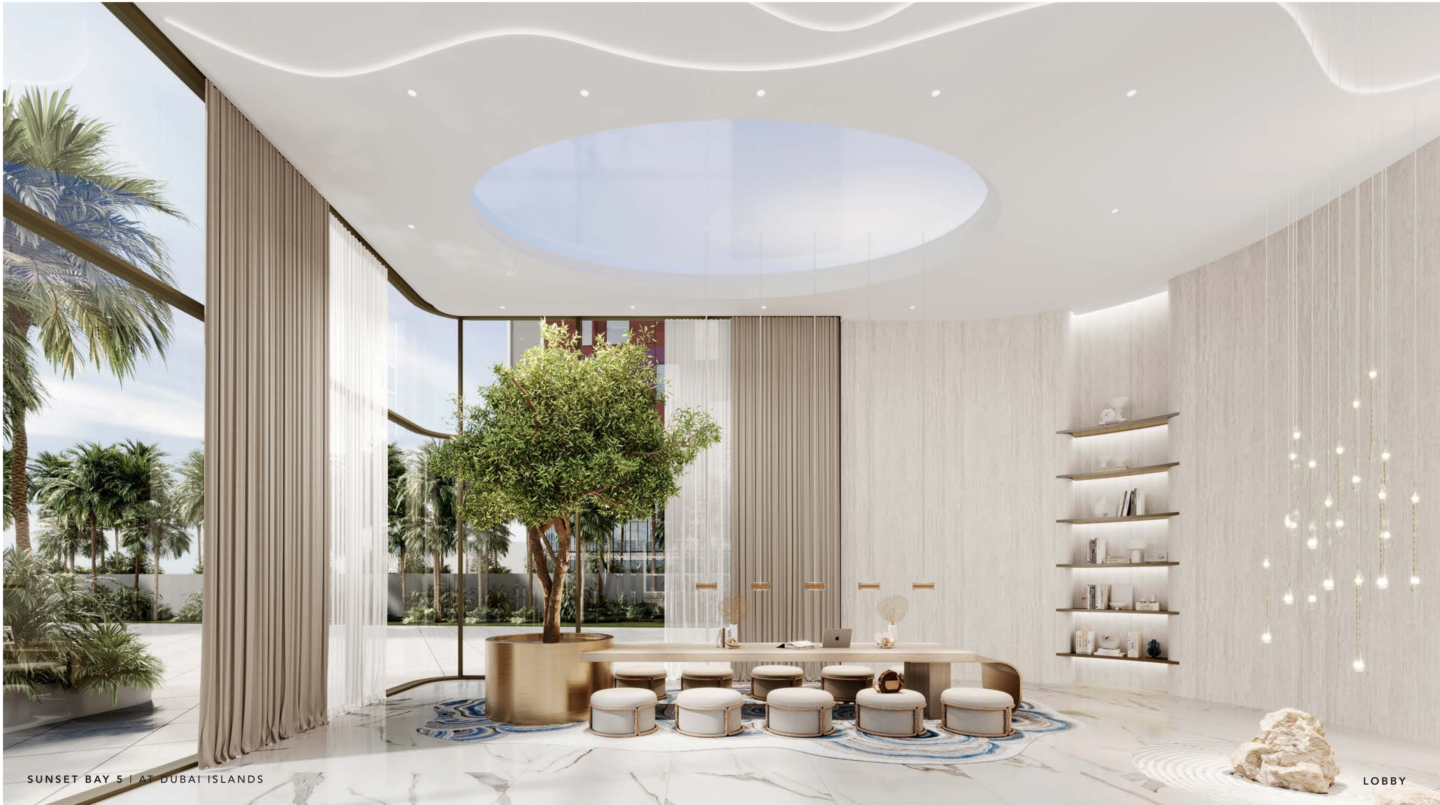
SUNSET BAY 5 | AT DUBAI ISLANDS