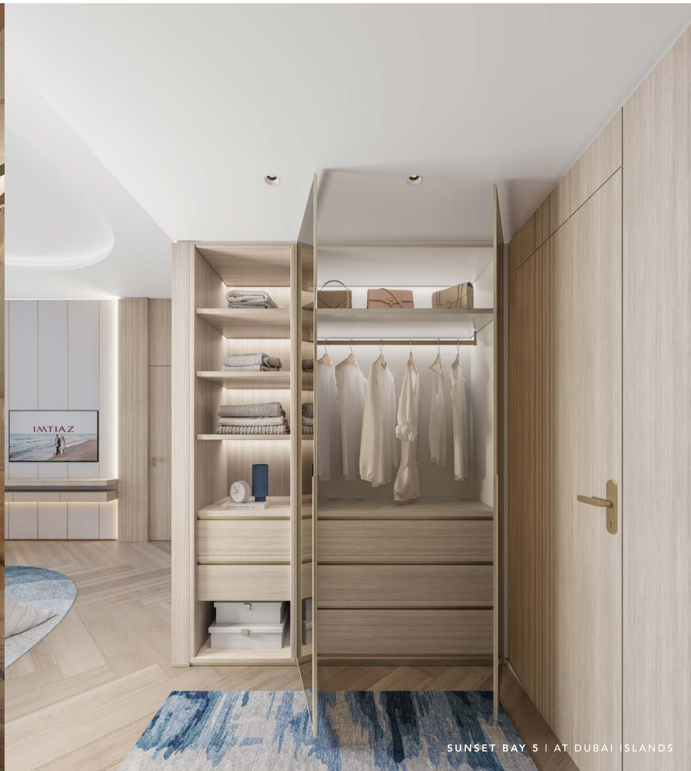
SUNSET BAY 5 | AT DUBAI ISLANDS