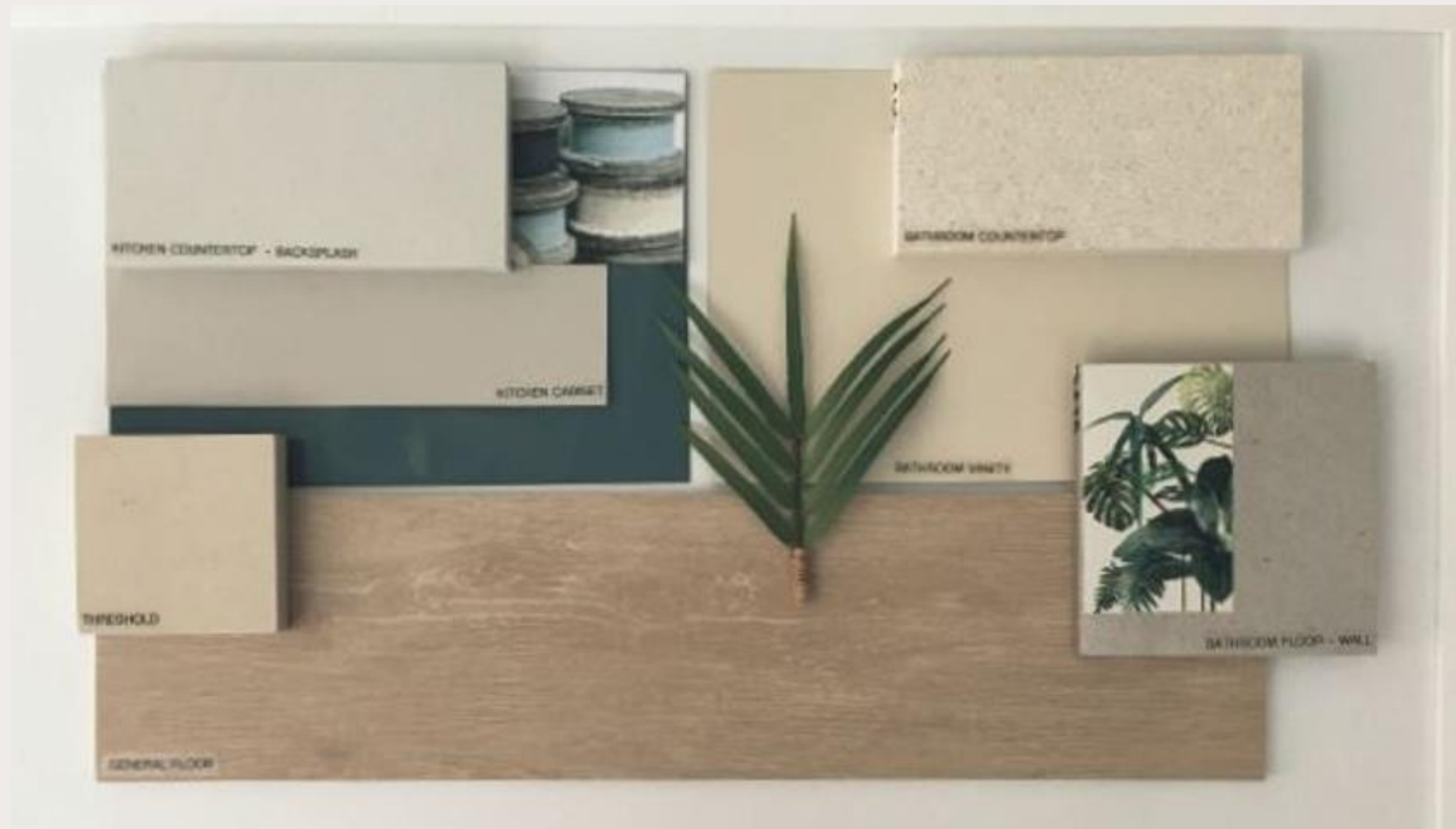
INTERIOR DESIGN SCHEME