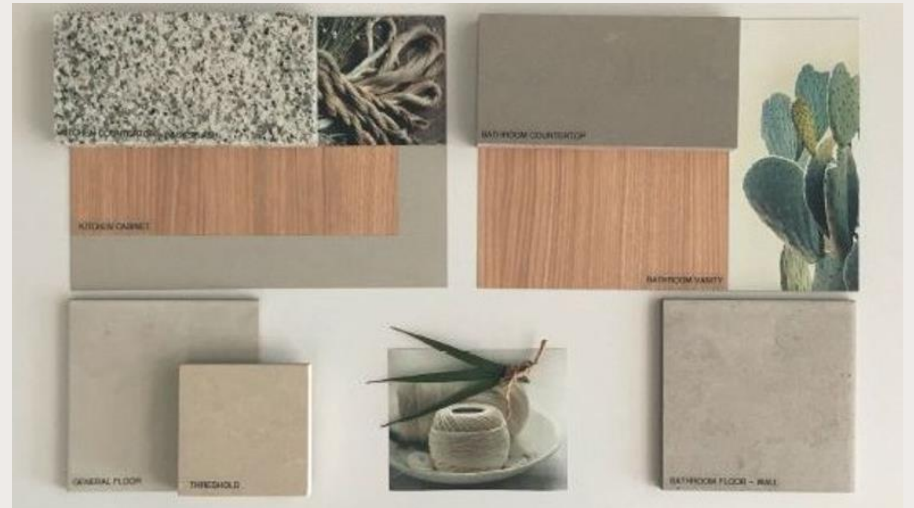
INTERIOR DESIGN SCHEME