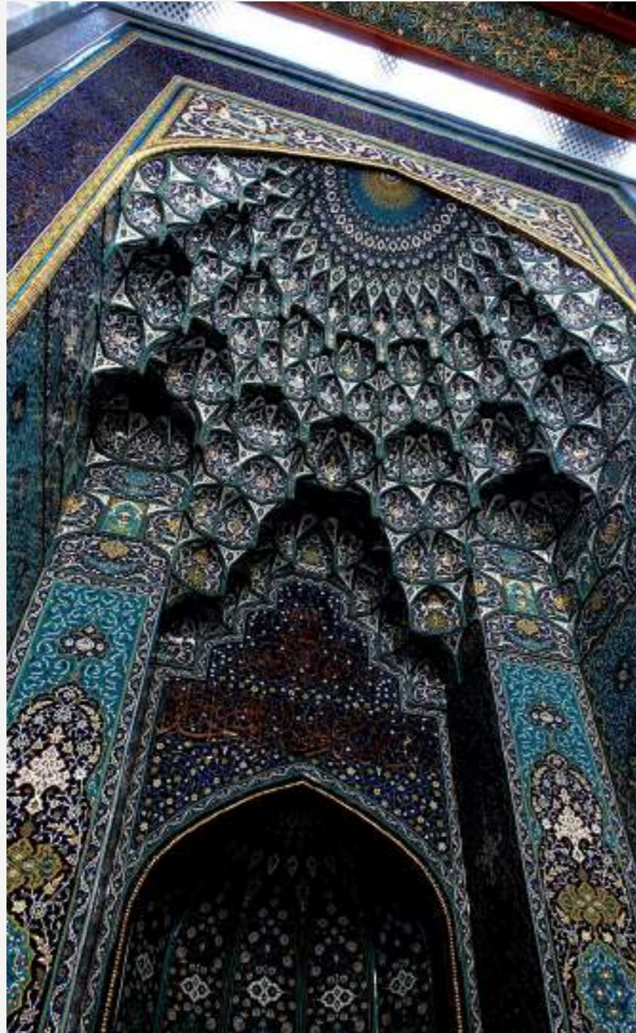
Sultan Qaboos Grand Mosque